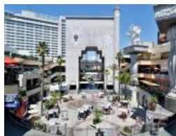
New Age Electronics' Retail Dealer Summit