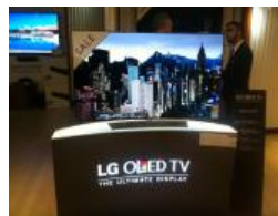
Scenes From Harrods