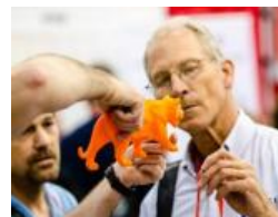
D&H's Mid-Atlantic Summer Tech Show