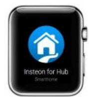
Top Tech & Retail Apps For The Apple Watch